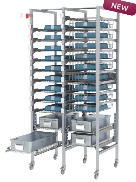
HYGIEIA RACK Aluminum Racking System