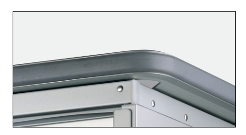
Upper all-around bumpers for transporting inside trucks

Rigid heavy-duty aluminum structure carts for transporting of sterile and non-sterile medical equipment between campuses or between central sterilization and the receiving departments