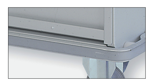
All-around lower bumpers