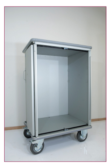
Release locking knobs (Tool free)