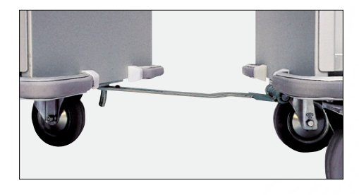
Dedicated hooking structure for safe towing